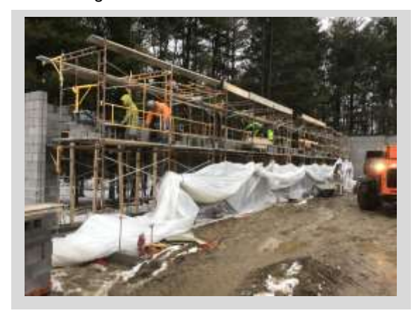
CMU Block Placement at North Wall