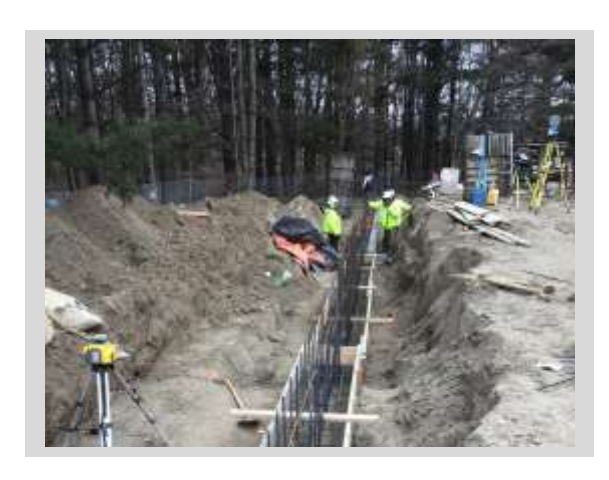
Wall Footing Formwork at Exterior Wall